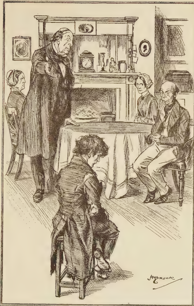
Mr. Chadband on "Terewith"